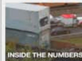
INSIDE THE NUMBERS

Transportation Matters January 21st, 2010